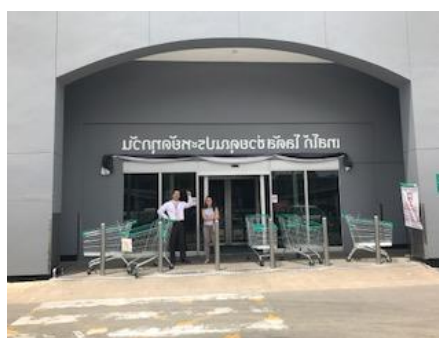
Shuttle bus pick up point