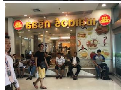
Student Waiting area

At the bottom of the escalator make a left u-turn and proceed to the waiting area between Swensens & Chesters Grill. Students will wait in order, inside, until they are directed outside to be ready to board the next available bus.