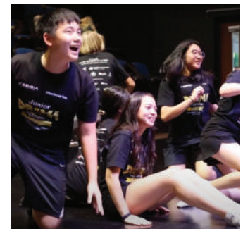
JUNIOR DRAMA FESTIVAL: "CULTURAL MEMORIES FESTIVAL"