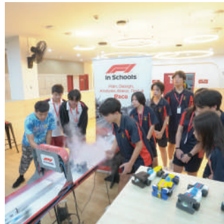
'FLYING HIGH' STEM COMPETITION