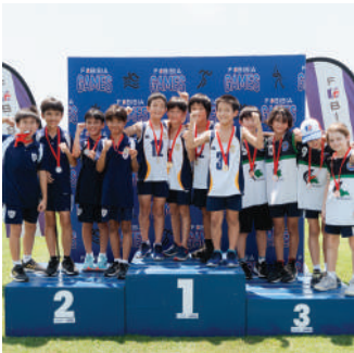
FOBISIA PRIMARY GAMES