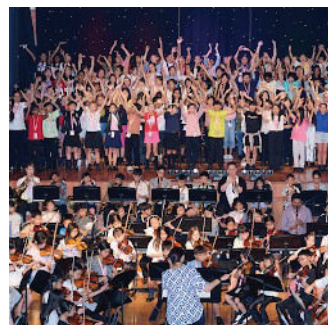
PRIMARY MUSIC FESTIVAL